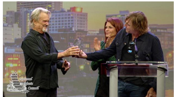
Rosanne Cash and Jack Ingram present the award to Kris Kristofferson

This year's celebration included tributes to the honorees by a host of musical greats, including Rosanne Cash, Jack Ingram, The Oak Ridge Boys, Dwight Yoakam, and John Oates.