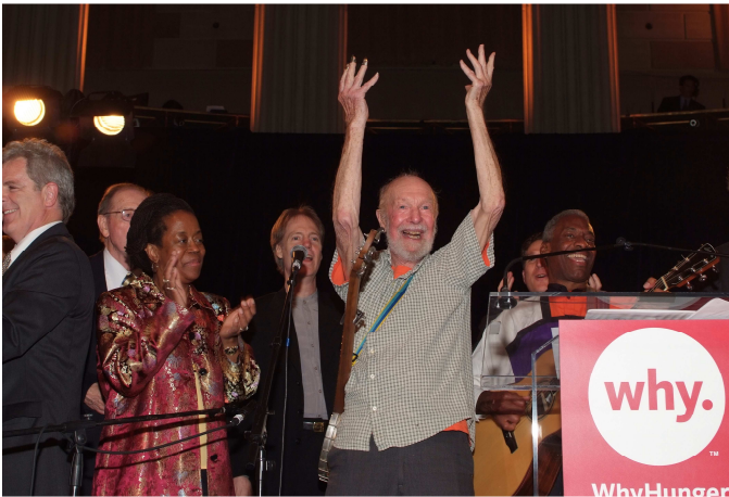
Pete Seeger and friends at the WhyHunger Awards finale